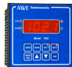
BC7635 in 96 x 96 Din housing